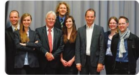
World Resources Forum Team