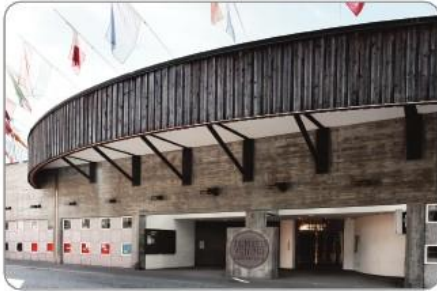
Davos Congress Center